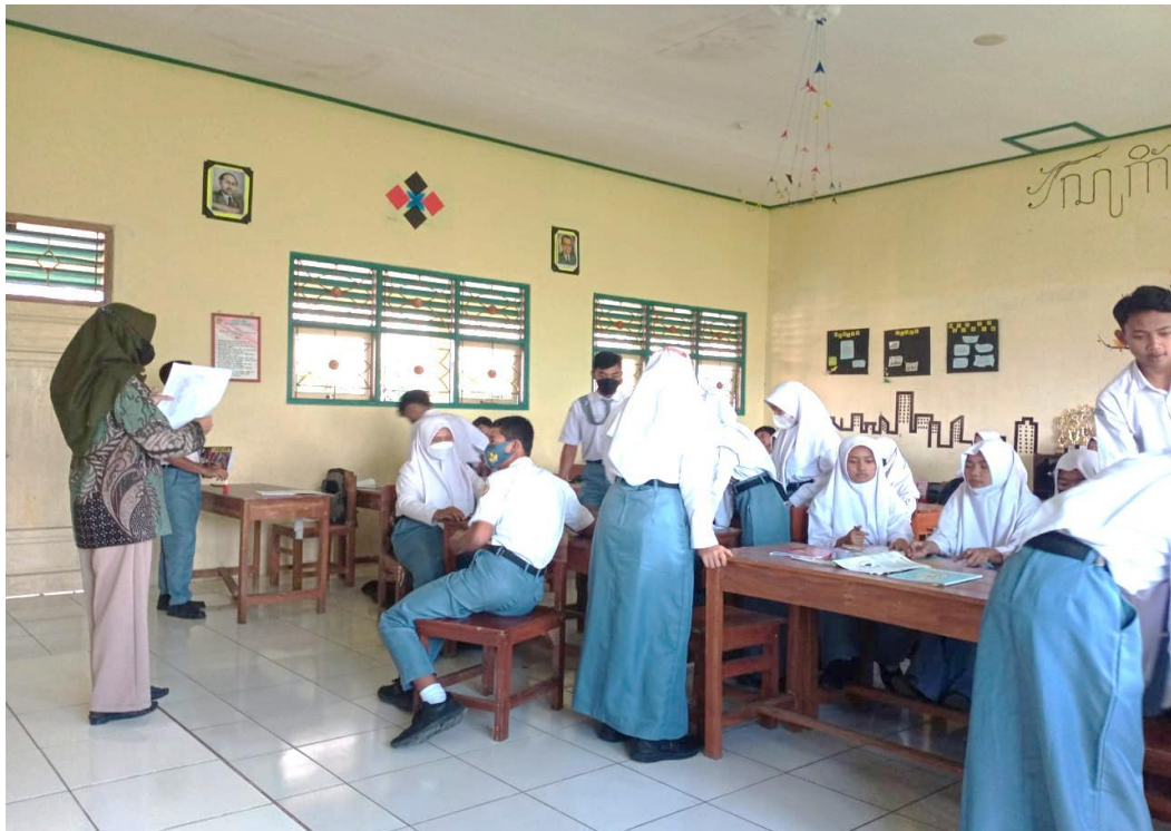
Picture. 4. The Students Create Groups for Discussion