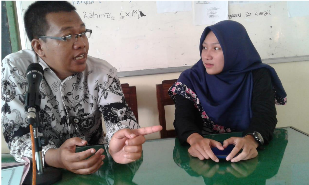
Picture. 1. Discussion with English Teacher during Observation