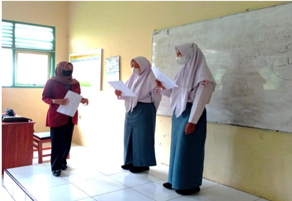
Picture. 3. The Students' Dialogue Performance