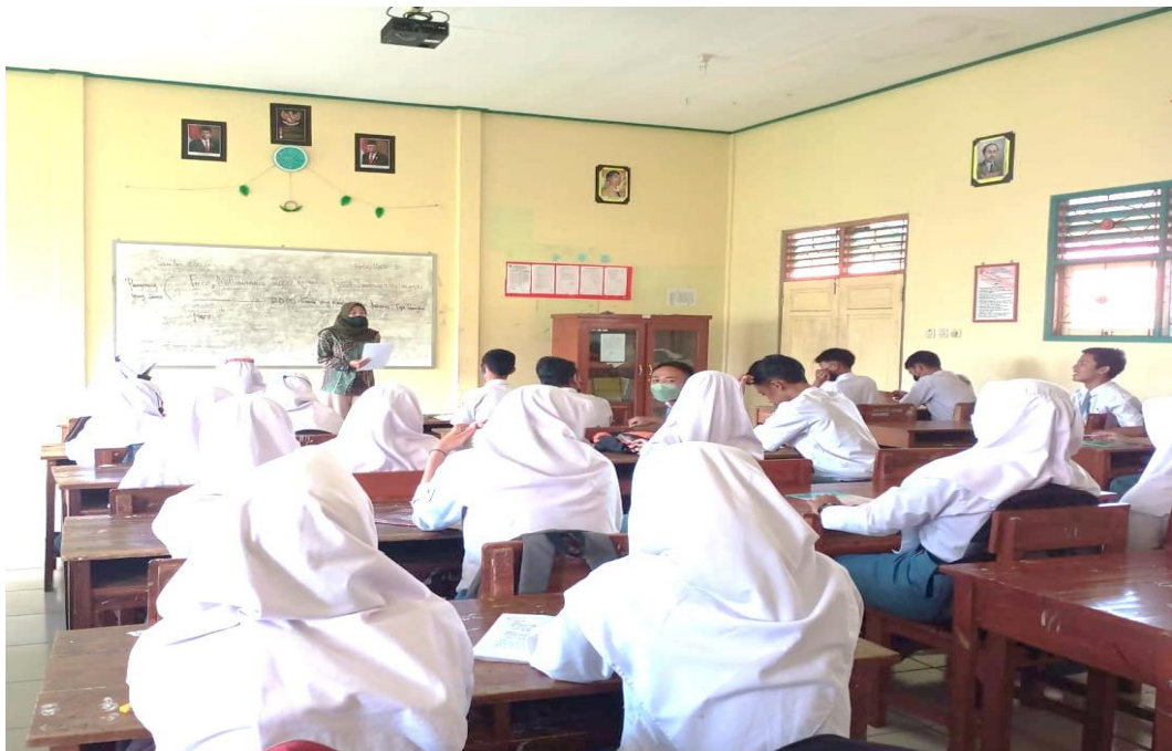
Picture. 2. The Writer Explains the Material