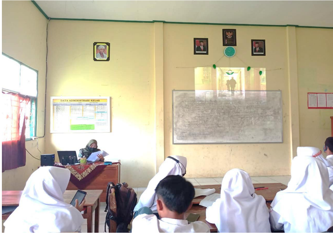
Picture. 5. The Students are Paying Attention to the Film shown by the writer