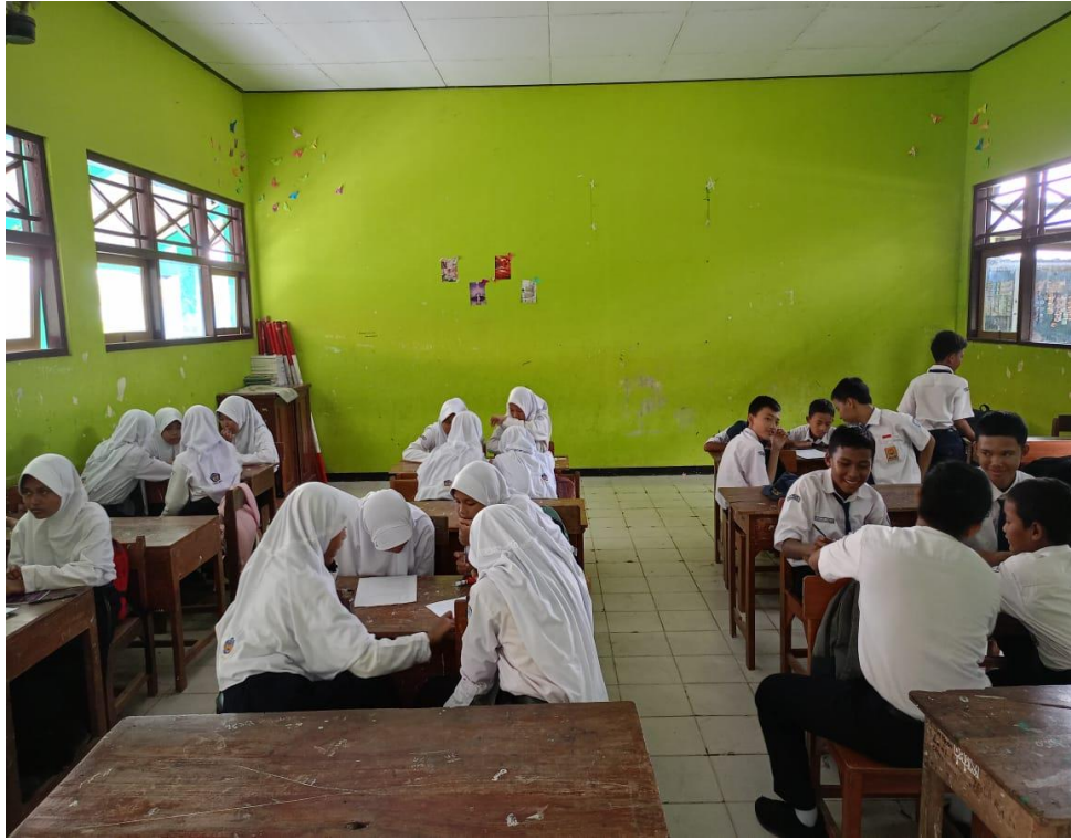
Picture. 5. Post-test activity of Control class