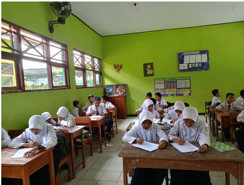
Picture. 6. Post-test activity of Experiment Class