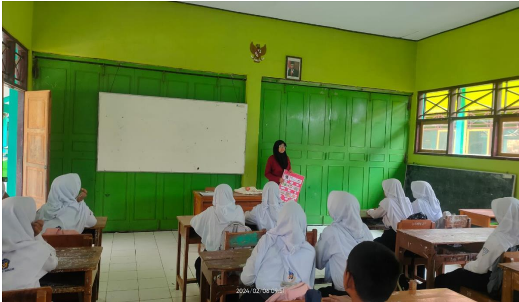
Picture. 3. Meeting 1 Giving treatment and introduction of picture media while singing a song in experiment class