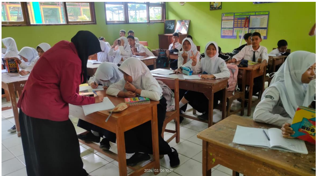
Picture. 4. Meeting 2 Giving treatment and discussion learning materials about Picture media in Experiment Class