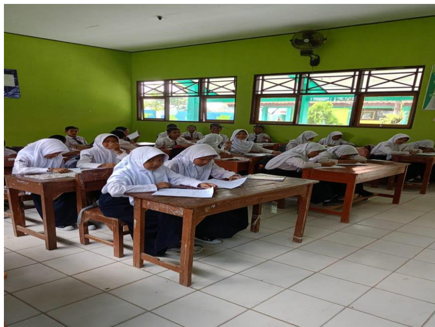
Picture. 2. Pre-test activity of experiment class