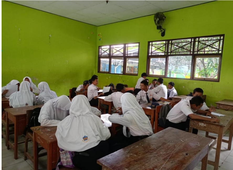
Picture. 1. Pre-test Activity of Control Class